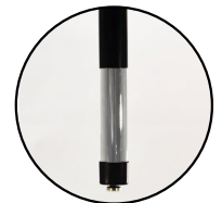
Premium Elliptical NeoClass® Leg